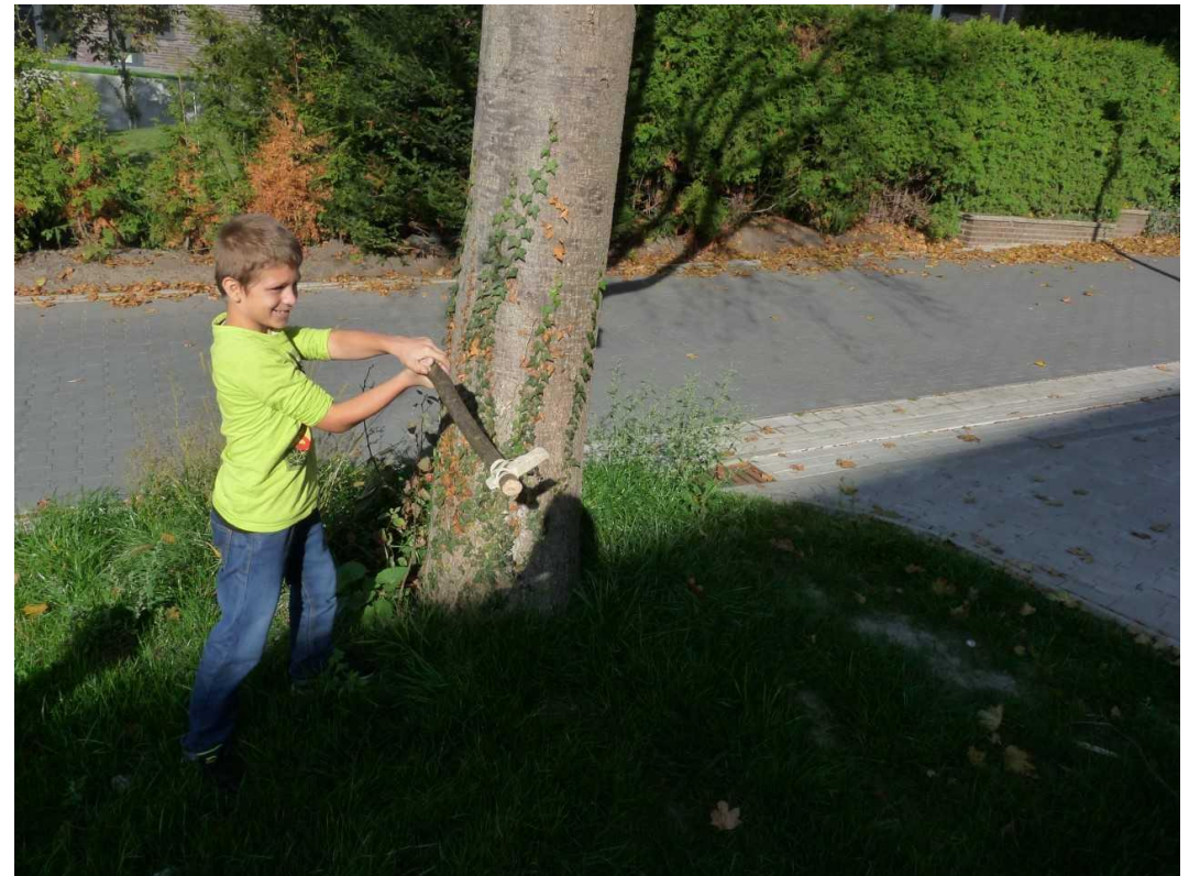
A selfmade replica of a stone age axe