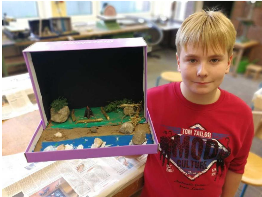
A landscape in a shoebox