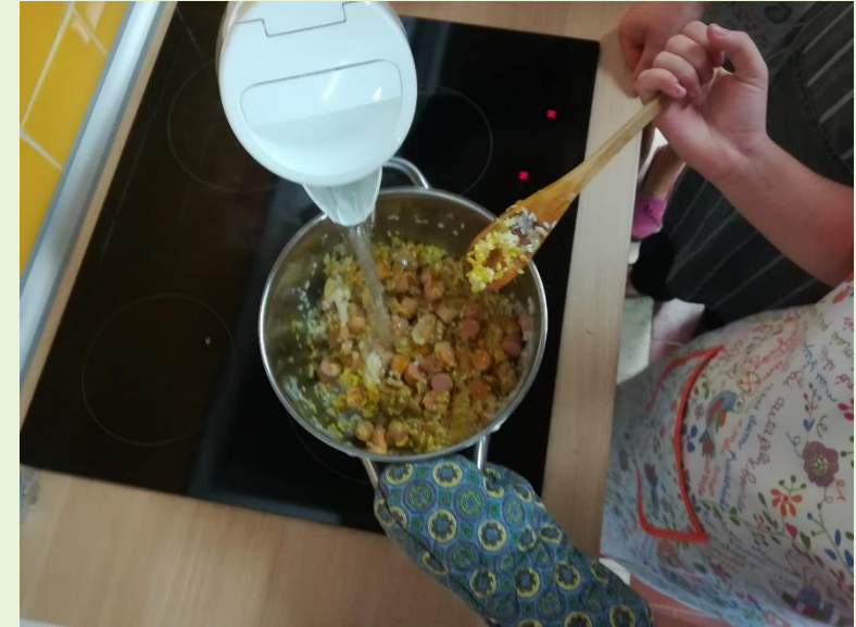
Cooking with Saffron