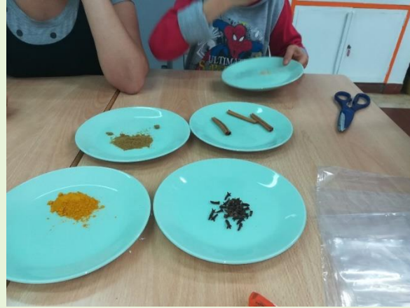
Colours, smell and taste

Cooking recipes with spices: egg pudding with cinnamon and saffron rice.